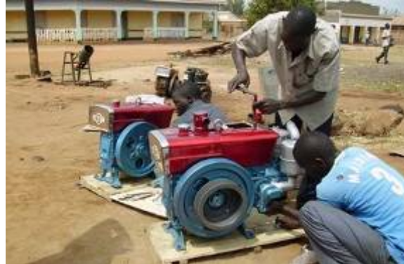
Telela, Uganda, Grainmills for food and income