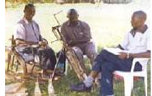
Jinja Central, Uganda Computers for disabled youth

Neighbours helped write a plan for the project, compiling a budget and estimating costs for tools, maintenance, training, equipment etc, and researched potential donors to fund the project. Then Neighbour Frank from the Netherlands met with Sander van Zant of ICUganda, and convinced the group to help fund the grain mill project. Workers from Telela are now making bricks and preparing the site where the grain mills will be housed. Once the structure is in place, ICUganda has pledged to make an extended visit to the village to support installation and operation of the grain mills.