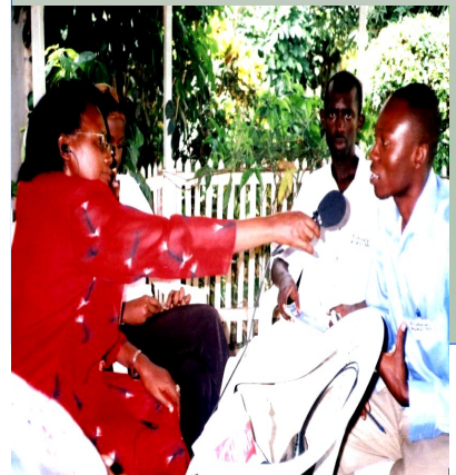
Journaliste at National Radio during Workshops on nutrition 2007.

JECTV digital communication strategy continuously seeks to help find answers to such questions via interviews .