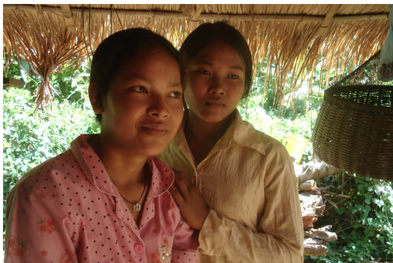
Young women out of school in Prah Phos commune during the CYDC assessment