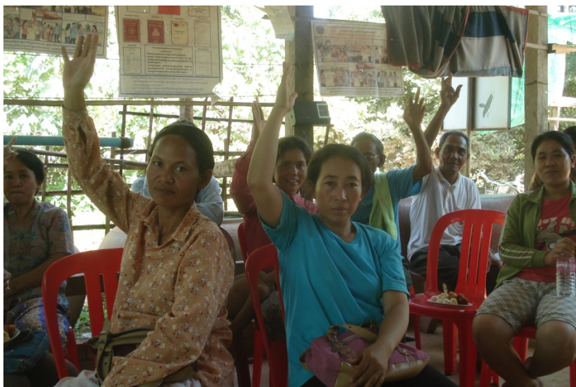
Community decision-making in action in the village bank in Russey Krang commune

CYDC maintains good relations with local community leaders and leaders are positive about and actively engaged in CYDC's work. Indeed, several of the interviewees mentioned supportive local leaders as one of the strengths of their communities. Their support is a useful resource which will allow CYDC to operate effectively and with confidence. The skill capacity and education level of many local leaders remains low however, which impairs their ability to effectively lead their communities to sustainable development. CYDC has already led several training sessions involving local leaders, educating them on basic rights, land law, marriage law and conflict resolution. Leaders were receptive to this training, and on several occasions during their interviews with local leaders, CYDC staff were asked for their opinion about how a recent issue, usually a family conflict in the village, should be dealt with. This suggests that there are opportunities to make real progress in building the capacity of local leaders to engage them fully in the development of their communities.