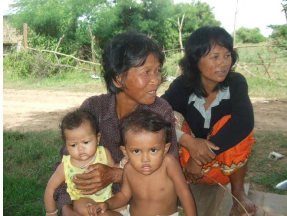
A typical interview setting with women household and disable in Prek Chek commune