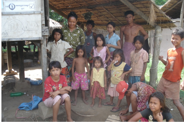
A family from the CYDC assessment village in Chrey commune