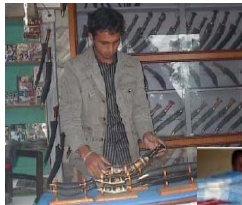
Raj Khukuri Industry, and Allo Clothes in Sankhuwasaba

Headquarters of the District, the hillside town is relatively modern. Every house has a piped water supply, the telephone, and electricity facilities. Internet connection is available as well as all the trekking materials you could need.