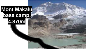
Mont Makalu base camp, 4,870m

Mont Makalu, which is considered by many to be one of the most beautiful peaks in the world, is located in the northern part of the district and dominates the horizon. In addition to Mont Makalu, the district is also decorated with many others snow capped mountain peaks.